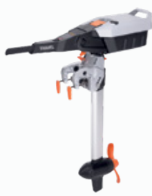
Torqeedo Travel S 3hp / From $2998