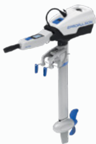
ePropulsion Spirit 1.0 Plus 3hp / $2999