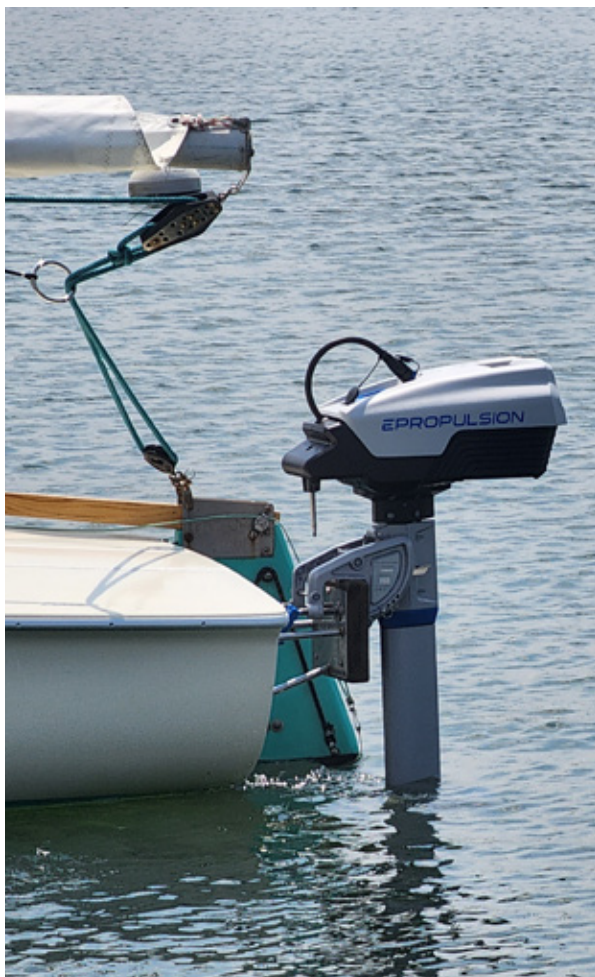
ePropulsion outboard motor on a Flying Scot transom.