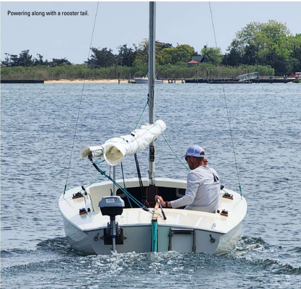
Powering along with a rooster tail.

At the end of the day, you and I own Flying Scots because we're sailors. Many of us don't want or need to rely on a motor when we have wind in our sails. But my experience as a Flying Scot sailor of almost 20 years, and now someone who makes part of their living selling electric outboards, has convinced me of two things. First, sailors who already have a gas outboard on their Flying Scot should consider switching to electric. Unless the cost is a prohibitive factor, there is no good reason to own a small gas outboard. Electric outboards are easier to use and maintain and provide a better boating experience. Second, Flying Scot sailors who don't have an outboard on their boat should consider an electric motor. A small electric outboard like the ePropulsion eLite is a cheap insurance policy against the wind dying; if you cancel your Sea Tow membership, it will