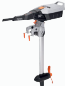
Torqeedo Travel XP 5hp / From $3998