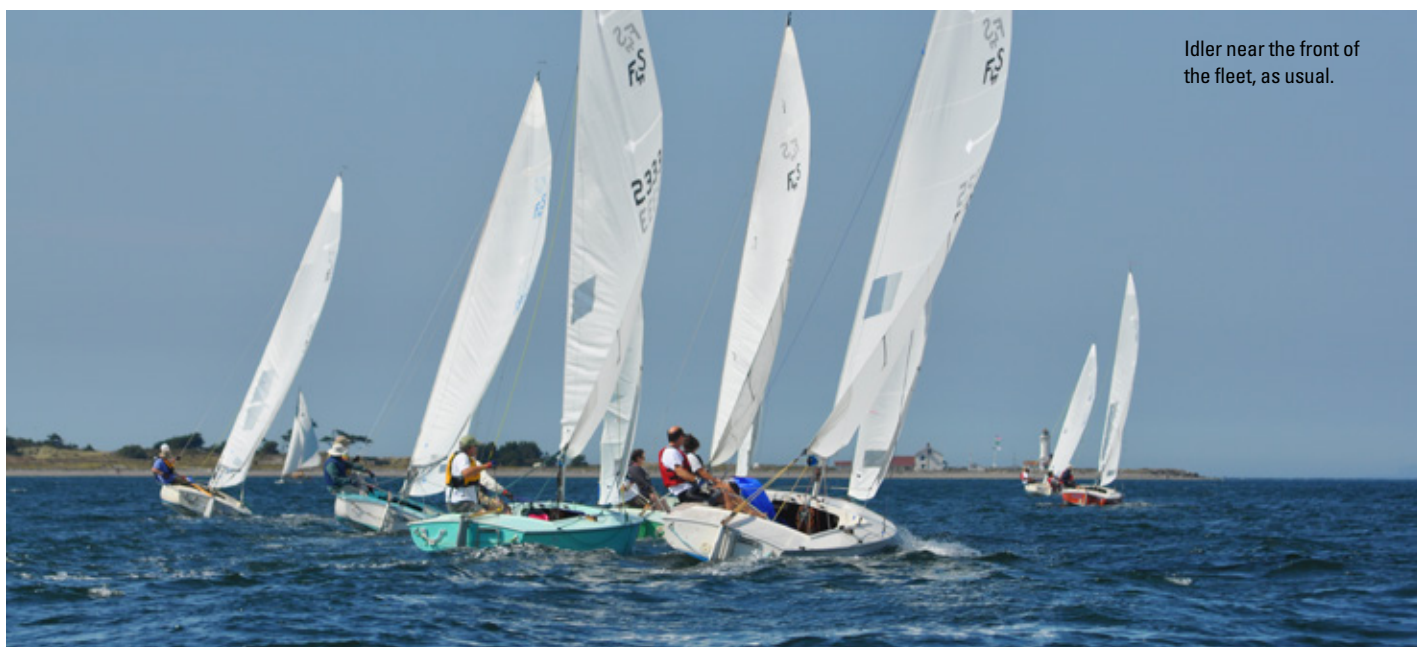
Idler near the front of the fleet, as usual.