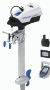
ePropulsion Spirit 1.0 Evo 3hp / From $3606