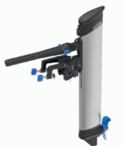
ePropulsion eLite 1.5hp / From $1149

Quiet - Eco Friendly - Low Maintenance - Reliable - Light Weight - Portable