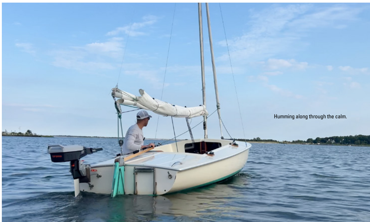
Humming along through the calm.

If I had a sunset cruise and the wind looked questionable, I'd have the Torqeedo on the motor mount before leaving the dock. If the wind died, I'd center the mainsail, furl the jib, lower the motor into the water and go. Half the time my customers wouldn't realize it was on!