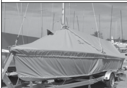
Skirted Mooring Cover above. We also make "Mooring" without skirt, Trailing-Mooring, Mast, T-M Skirted, Bottom, Cockpit, Rudder, Tiller covers.

www.sailorstailor.com (Order Covers On-Line or Call Toll-Free)