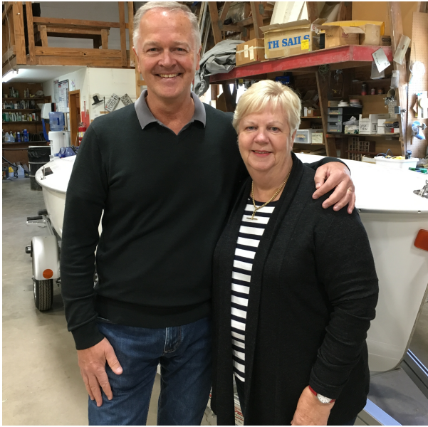
Making it Real