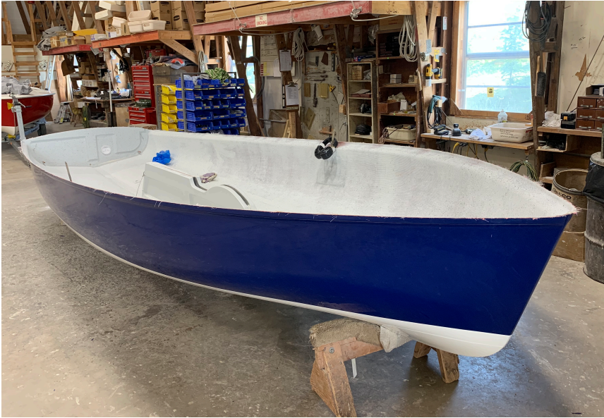
#6181 Hull with Gel Coat