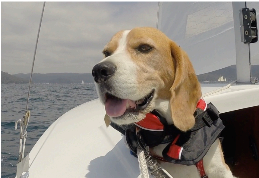
Cooper the sailing Beagle

Having been out for an hour or so, the winds were far too strong for such a novice team. A couple of times with the main sheet cleated, a puff of wind would remind us to keep an eye on the changing conditions. We lost a hat overboard while tacking, a quick decision to come about and retrieve the cap as we were heading towards a car ferry crossing the river. All our sensors were now at a heightened level.