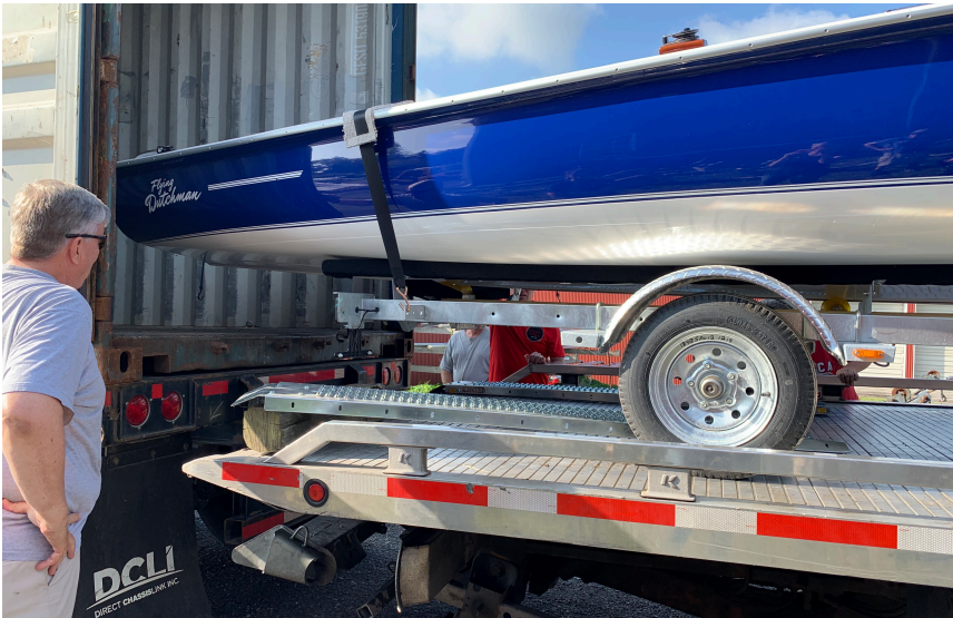
Loading #6181 into the 40' Container