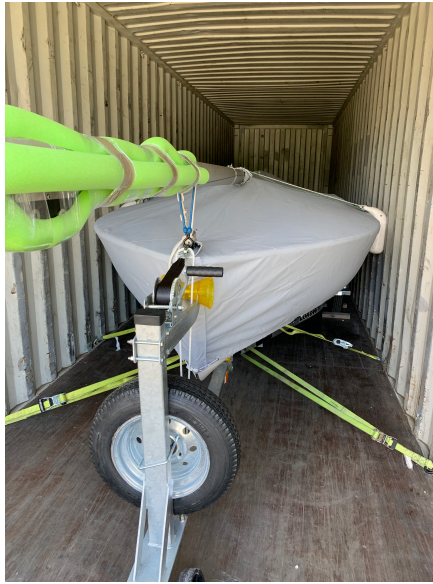
Packed up and ready for the long voyage