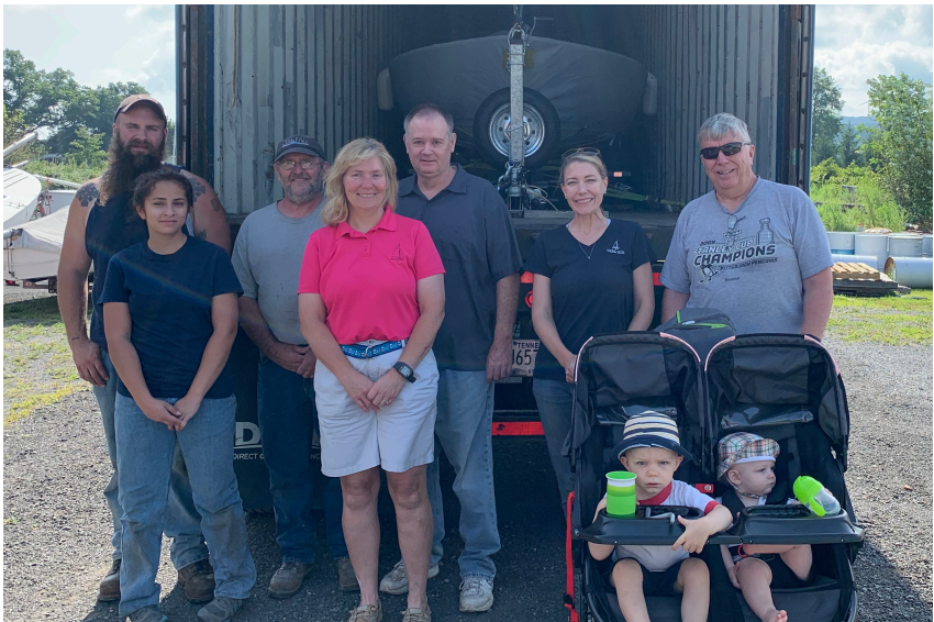
Flying Scot Inc® family