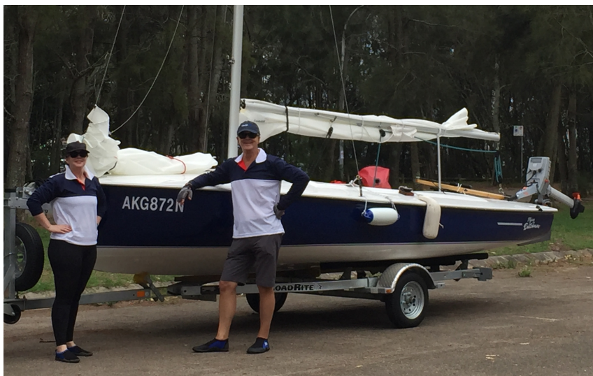
All rigged and ready to go